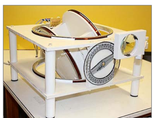
Fig. 2: Apparatus to measure M in function of angle, on pairs of about 300-mm in diameter.

In the Fig. 2 it is a device used to determine some parameters of the formula.